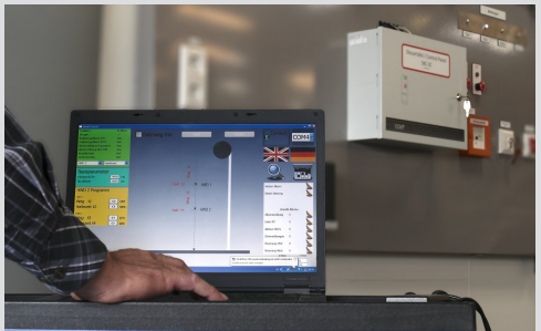
ASB types 2 and 4 Without fail-safe function

SKC-SC controls fire curtains and smoke curtains. It has been tested in accordance with prEN 12101-9 and BS 8524. It has a power supply to maintain the control functions for at least 72 hours in accordance with EN 12101-10.